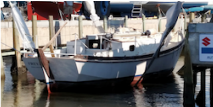
Freya in slings at St. Augustine, Fl.

For more information about the Freya, the man who built her and the Gwynn's Island boat shop where she was built go to www.gilbertklingel.com